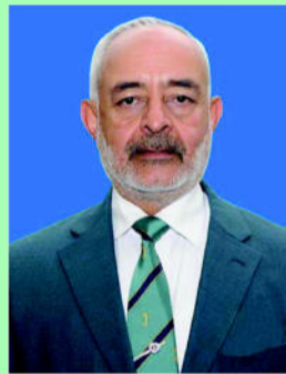
(Admiral D K Joshi) PVSM, AVSM, YSM, NM, VSM (Retd.) Lieutenant Governor Andaman & Nicobar Islands & Vice Chairman, Islands Development Agency

On this occasion, I extend my best wishes for success of "Animal Welfare Fortnight-2022" celebrations.