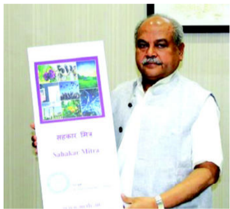
NCDC website.

New Delhi, June 13 Union Agriculture Minister, Shri Narendra Singh Tomar launched 'Sahakar Mitra' Internship programme to provide paid internship to youth and ensure availability of assured project loans to young cooperators yesterday. Launching the scheme, Shri Tomar said that, National Cooperative Development Corporation (NCDC), has embarked upon a series of initiatives in the cooperative sector entrepreneurship development ecosystem, through capacity development.