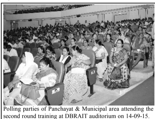
Polling parties of Panchayat & Municipal area attending the second round training at DBRAIT auditorium on 14-09-15.

on date, total 764 votes have been casted through postal ballots for PBMC and Total 1260 for various Panchayat posts. Postal ballots will be issued and collected till Sept. 17, 2015 by the Returning Officers. All Returning Officers have been instructed