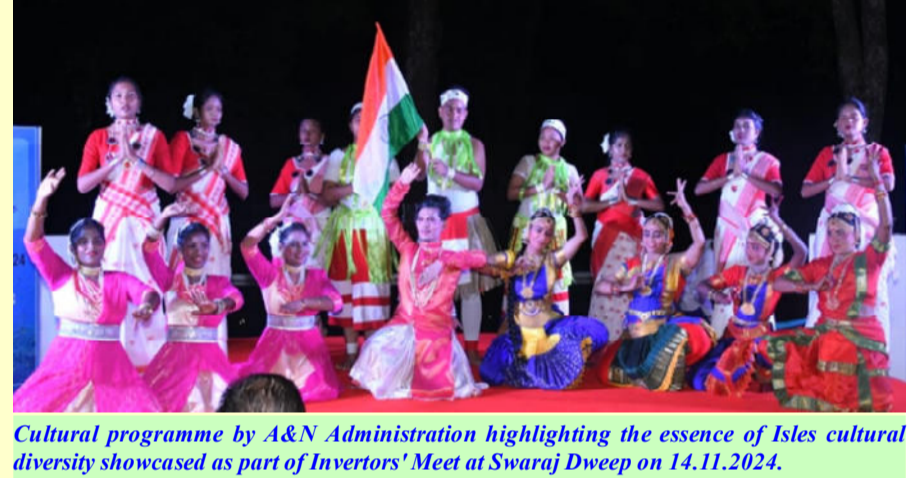
Cultural programme by A&N Administration highlighting the essence of Isles cultural diversity showcased as part of Investors' Meet at Swaraj Dweep on 14.11.2024.