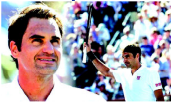
Second seed Rafael Nadal also reached the last eight with a straightforward 6-3, 6-4 victory over Filip Krajinovic. The Spaniard will play Karen Khachanov next following the Russian's 6-4, 7-6 win over John Isner.

Wells, mar 14 Roger Federer beat British number one Kyle Edmund to reach the quarter-finals at Indian Wells. The Swiss, a five-time champion in California, eased past Edmund 6-1, 6-4 in just over an hour. World number four Federer, who has yet to drop a set at the tournament, saved all seven break points that he faced and won 79 per cent of first serve points.