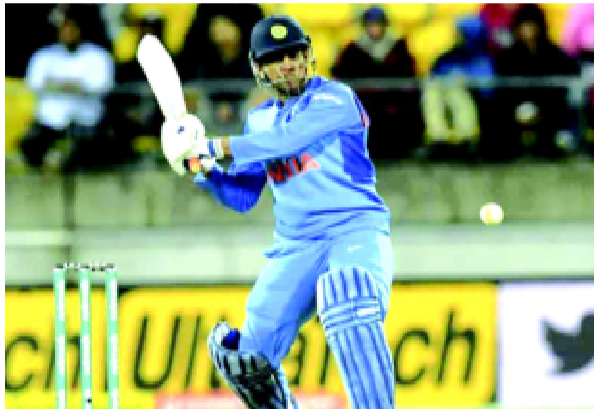
in the just-concluded five-match series even as the Australians made a remarkable comeback by winning three consecutive matches. Incidentally, Dhoni did not feature in the last two games with young wicketkeeper Rishabh Pant struggling to fill in the former India captain's shoes.

New Delhi, Mar 14 Former Australian captain Michael Clarke on Thursday warned critics to "never underestimate" the importance of veteran Mahendra Singh Dhoni in the Indian limited overs teams. Clarke tweeted after the Australian team beat India in the fifth and final ODI at the Feroz Shah Kotla for a stunning come-from-behind 3-2 series win in New Delhi on Wednesday. "Never underestimate the importance of MSD — experience in the middle order is so important," Clarke, a World Cup-winning captain, wrote on his twitter handle about the seasoned player who has also led his country to two World Cup triumphs. India surrendered a 2-0 lead