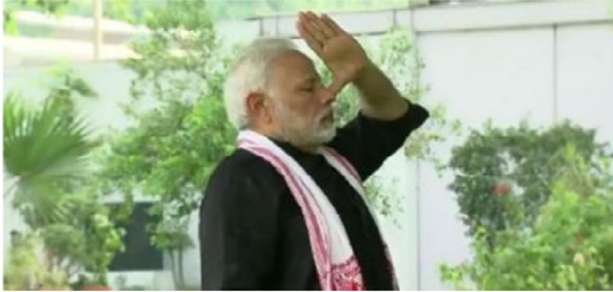
Challenge given by Virat Kohli, also shared his fitness video on social media about his morning exercises. He said, apart from Yoga,

New Delhi, Jun 13 Prime Minister Shri Narendra Modi has appealed every citizen of the country to devote some part of the day towards fitness. In a tweet, Shri Modi has also asked people to practice any set of exercises in which they are comfortable. He said, this will bring a positive difference in their life. The Prime Minister, accepting the Fitness