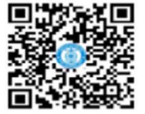
Scan QR Code to open on mobile.

Sri Vijaya Puram, Apr. 15 The unused/surrendered tickets, if any, available from the reserved quota for the scheduled sailing of Vessel Nalanda for Kolkata on 17.04.2026 will be made available to the general public from 1100 Hrs onwards on 16.04.2026. Tickets can be booked through the DSS e-Ticketing Portal: https://dss.andamannicobar.gov.in/eticketing . Alternatively, tickets may also be purchased from STARS Ticketing Counter. For user convenience, a QR code linking directly to the e-ticketing portal has also been provided.