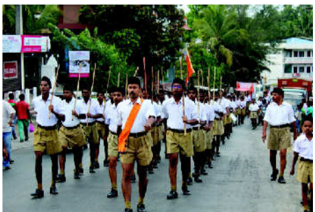
Rashtriya Swayamsevak Sangh conducted route march from Prothrapur Community hall to Garacharma Basti on 15.05.2016.