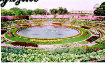
Facts about Mughal Garden we bet you did not know