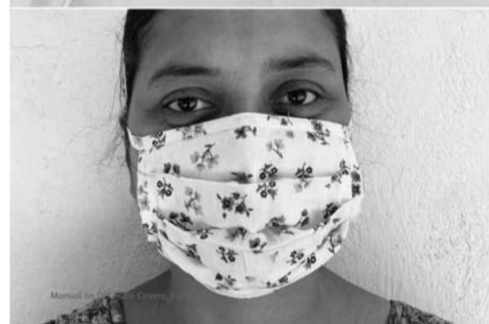
This face cover is currently being used by community health workers of organizations in South Rajasthan including, Amrit Clinic, Arth Hospital, and Shreyas Hospital.

You must never reverse the face cover for reuse. Always thoroughly wash it after every use following process shown further.