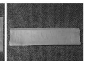
Fold this again evenly from the middle as shown