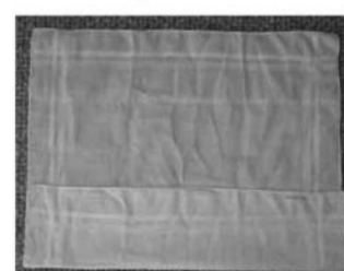
Fold the handkerchief from one side to little above the middle of the cloth