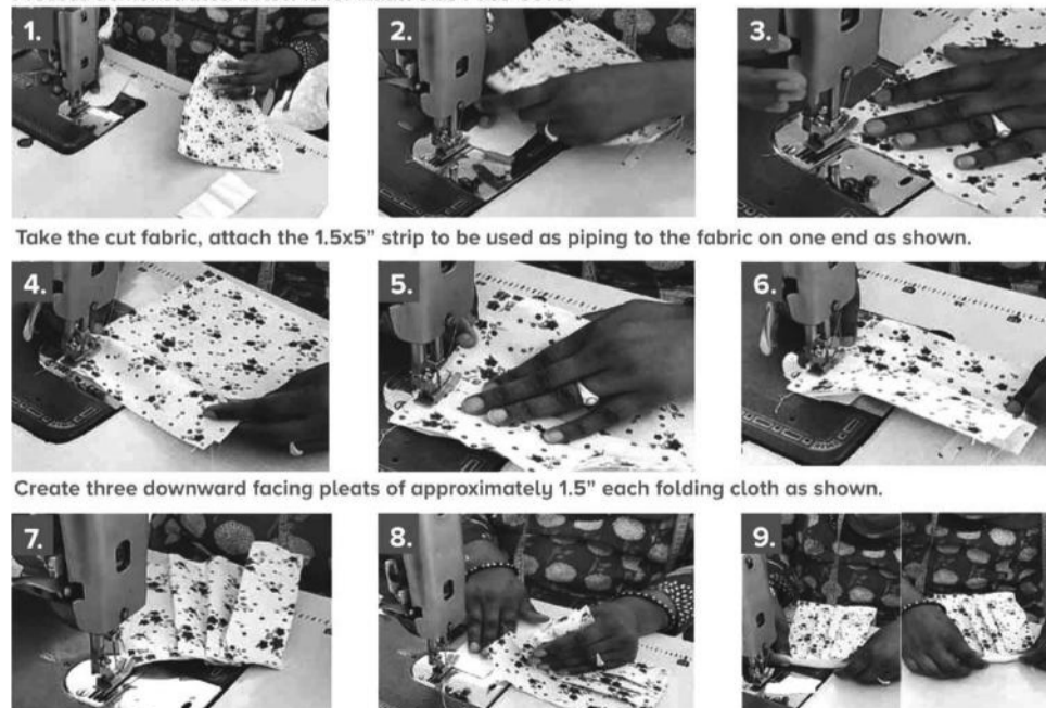
Take the cut fabric, attach the 1.5x5" strip to be used as piping to the fabric on one end as shown.

Process demonstrated below is for Adult Size Face Cover