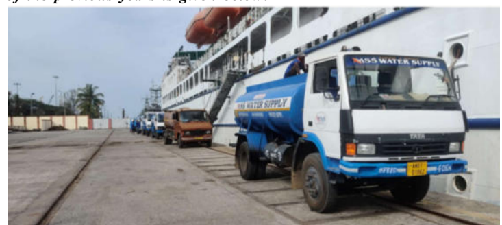
Water distribution by BMC tankers from the water transported by MV Campbell Bay from Hut Bay, Little Andaman.

While the total rainfall the last 3 years (2016-17 to 2018-19) was between 399 mm to 646 mm, there was