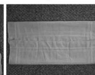
Now fold over the other edge to go above the first fold