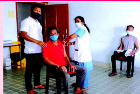
Vaccination drive at CHC Nancowry

Port Blair, May 15 The vaccination drive is continuing in A&N Islands in an effective manner and health teams designated in various vaccination centres spread across the Islands are vaccinating all the beneficiaries above 45, who visit the centres spread over the A&N Islands on a daily basis. The vaccination sessions are continuing in more than 88 designated