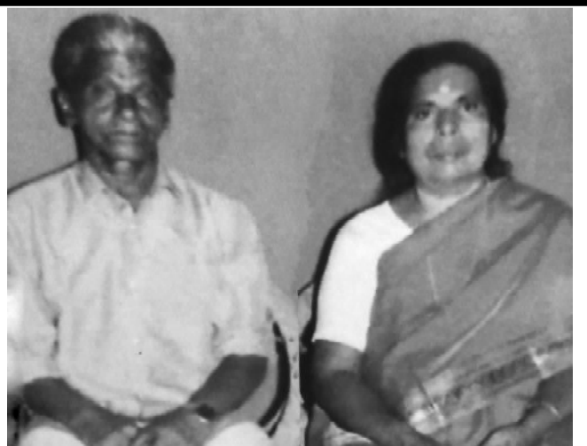
Miss you both Acchan & Amma