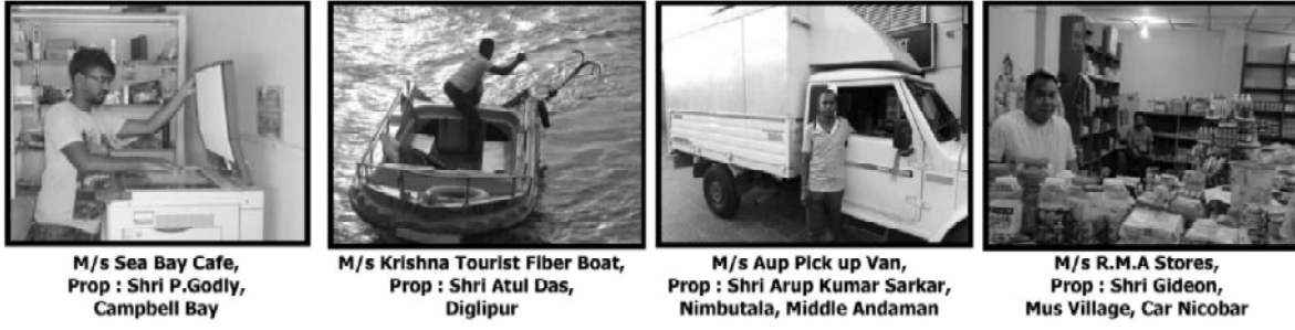
M/s Sea Bay Cafe, Prop : Shri P.Godly, Campbell Bay