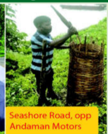
Seashore Road, opp Andaman Motors

Welcome Park, Haddo, India Garden, Food Court premises, Seashore Road, Haddo, Dollygunj Play Ground,