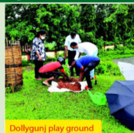
Dollygunj play ground

In continuation to its 'Green Port Blair' drive, PBMC has planted various saplings of fruit bearing trees in different locations/parks covering the entire municipal area during the month of July coinciding with 'Van Mahotsava 2021'. The plantations were done at Balidan Vedi Park, Marine Hill, Reacon Park, VIP Road,