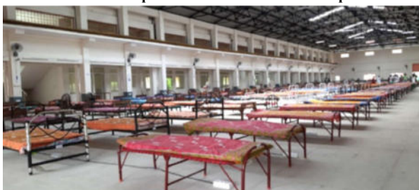
Dhanvantri Hospital is also in service, six COVID Care Centers that are more dedicated have been set up with (Contd. on last page)

Port Blair, Aug 16 The Andaman and Nicobar Islands has seen a steep hike in COVID-19 cases in the past two weeks. Keeping in view the well-being of the citizens, the Administration has taken various steps which include recruiting new staff in Health Department and increasing the number of tele-consultants. All out efforts are being made to take care of everyone who has been unfortunately contracted with the virus. The main thrust of the Administration is to contain the spread of the disease and in this direction in South Andaman District, a weeklong lockdown has been declared from 11th August midnight to 18th August midnight, to restrain the unnecessary movement of people. It is to mention that each COVID-19 patient is under care and he/she is either in home isolation or in institutional arrangements. In addition to GB Pant Hospital, the Administration has also taken over the services of Pillar Hospital as dedicated COVID hospital. While