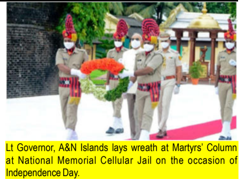
Lt Governor, A&N Islands lays wreath at Martyrs' Column at National Memorial Cellular Jail on the occasion of Independence Day.

Independence Day celebration was also held in Govt. Offices/institutions including schools, dispensaries, Post Offices etc and also in the Rural areas by the respective Pradhans of the Gram Panchayats.