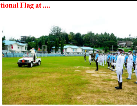
Mayabunder along with all Tehsils and inhabited Islands of the UT.

Further as per tradition, the National Flag was hoisted in district level ceremonial functions in Car Nicobar and in