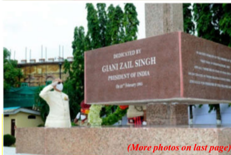
Lt Governor, A&N Islands lays wreath at Martyrs' Column at National Memorial Cellular Jail on the occasion of Independence Day.