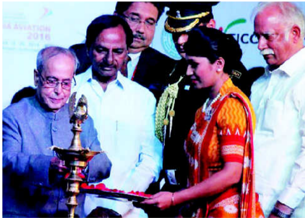
President Pranab Mukherjee (left) inaugurating the India Aviation 2016 event at Begumpet Airport in Hyderabad. He is surrounded by officials and a woman in a traditional saree.

Hyderabad, Mar 16 President Shri Pranab Mukherjee today exuded confidence that India will become a manufacturing hub especially in aerospace technologies in next ten years. He inaugurated the India Aviation 2016 at Begumpet Airport in Hyderabad this evening. He said the country requires 120 billion US dollars during next decade for development of aviation infrastructure in the country. He laid emphasis on linking of small cities and north-eastern states by air services. He further said the country will become third aviation market in the world after the US and China by 2020. He asserted that the country is a