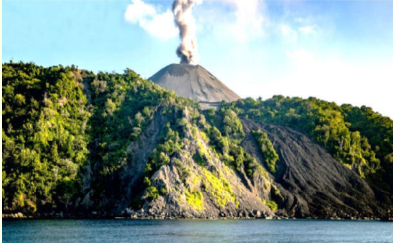
The Barren Island Expedition: Learning from Fire

The landscape of tourism in the Andaman and Nicobar Islands is currently being reshaped by a rigorous professional development programme. A comprehensive training framework has been established to improve the skills of the region's hospitality workforce, overseen by the Andaman & Nicobar Administration's Directorate of Tourism. On March 9, 2026, a specialised 12-day Tour Guide and Eco-Tour Guide Training Programme was launched, with the goal of preparing approximately 100 aspiring professionals with the technical and narrative skills needed to represent the archipelago's distinct identity. This ambitious educational project is being carried out in close collaboration with the prestigious Indian Institute of Tourism and Travel Management (IITM) in Bhubaneswar, ensuring that international standards of heritage interpretation are met.