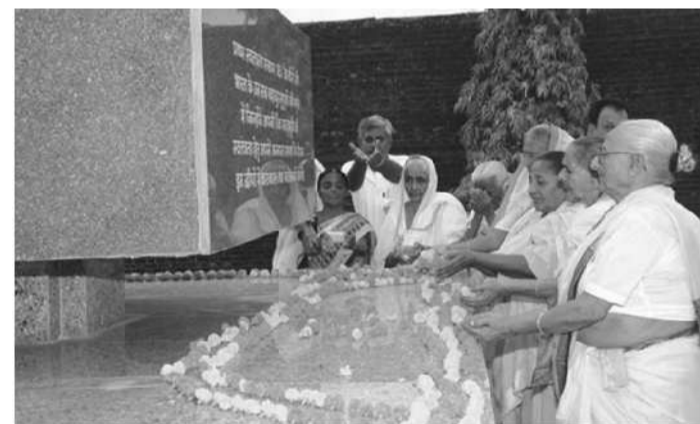
Widows of freedom fighters paying floral tributes at the Martyrs 'Column' Cellular Jail on 15.8.2016