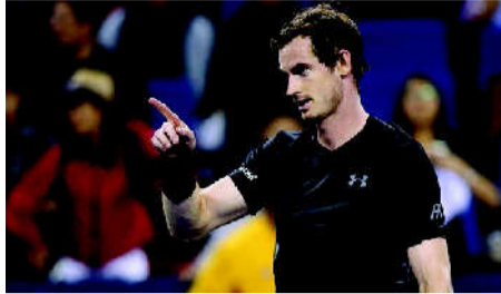
Murray, who won the China Open in Beijing a week ago, edged closer to Djokovic in the world rankings and is now 915 points behind the Serb, with a chance of finishing the year as world number one.