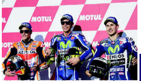
Marquez took the first corner, but was quickly overtaken by Lorenzo, who commanded the lead in the early phase of the Japan Grand Prix. Marquez and Rossi swapped second place several times in the second lap with the Honda rider keeping the upper hand. In the fourth lap, Marquez closed in on Lorenzo to take the lead and gradually expanded the gap.