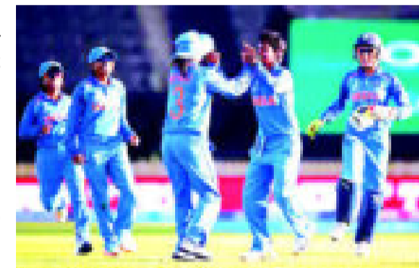
league for Women cricketers in India. Present and former Indian cricketers, including Mithali Raj have spoken out, asking for a tournament along the lines of IPL.

Mumbai, May 12 The Board of Control for Cricket in India (BCCI) has put plans in place for a Women's T20 exhibition game to be played on May 22 before the IPL Qualifier 1 at the Wankhede Stadium in Mumbai. It is understood that the match will follow IPL-style rules, with up to four overseas players allowed to be picked in the playing XI. This development comes in the backdrop of BCCI and CoA mulling a potential T20