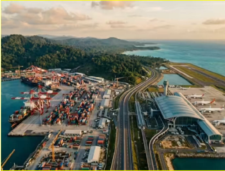
The Rs.90,000 crore Great Nicobar Project will span 166 sq km and include a major transshipment port, an international airport, and supporting logistics and urban infrastructure. (AI generated image)

The report also noted that oil flows to India from Russian ports have increased in recent