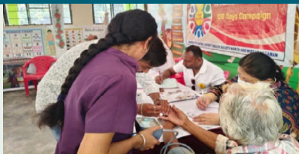
Ayushman Arogya Shivir at Govt. Primary School Borang, Mayabunder

focuses on a comprehensive and targeted approach to eliminate Tuberculosis (TB), with key objectives including: ♦ Early identification of all missing TB cases through proactive screening using chest X-rays and upfront NAAT testing among vulnerable populations and high-risk settings. ♦ Reduction in TB-