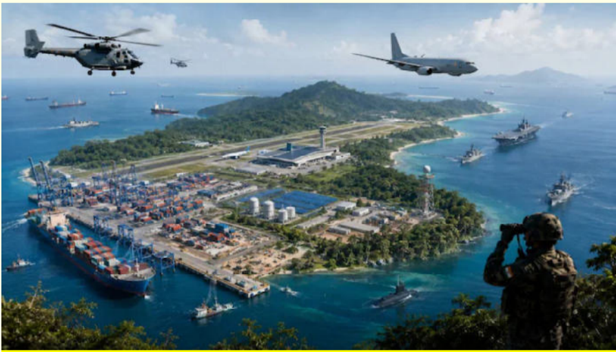
The Great Nicobar Project seeks to transform the island into a strategic maritime and economic hub. (AI-generated image)

project is located just 40 nautical miles from one of the world's most critical maritime arteries, carrying 50 per cent of global container traffic and roughly 80 per cent of global seaborne oil trade. It transforms India from being a mere observer in the Association of South East Asian Nations (ASEAN), into a key participant in the influential economic grouping. This is only one of the reasons that