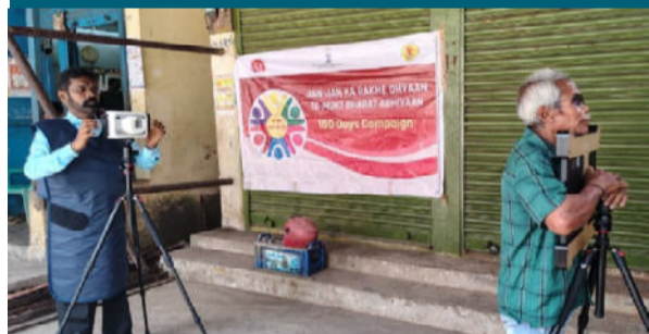
Ayushman Arogya Shivir at Kamorta Island, Nicobar District

Citizens urged to enroll as 'Nikshay Mitras' to support TB patients through nutritional & psychosocial assistance