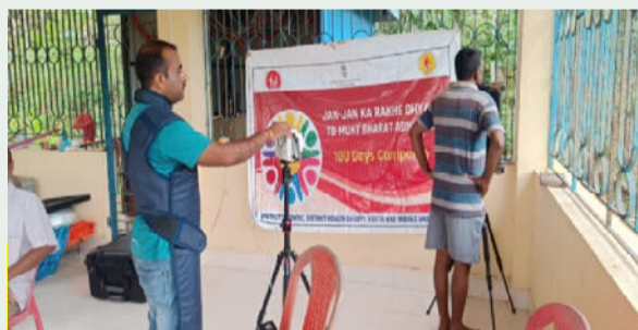
Ayushman Arogya Shivir conducted at Panchayat Hall, Laxmanpur, Diglipur

3. Individuals at higher risk-such as those aged 60 years and above, undernourished (BMI <18), diabetics, smokers or alcohol users (current or former), close contacts of TB patients, or those