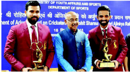
Speaking on the occasion Mr. Goel said while there is no doubt that cricket is among the most popular games in India, but the government is committed to promote indigenous and other sports as well.

New Delhi, Sept 17 Sports Minister Shri Vijay Goel today conferred Arjuna Awards on cricketers Rohit Sharma and Ajinkya Rahane at a function in New Delhi. Sharma was given the award for 2015 and Rahane for 2016. Earlier, the two cricketers could not receive the awards from the President Shri Pranab Mukherjee as they were participating in international tournaments.