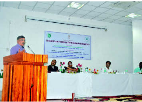
A speaker at a podium during the National Seminar on Scientific & Technical Terminology.