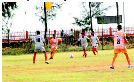
0 goals. The match between and Haryana ended in Navodaya Vidyalaya Samiti goalless draw.

Port Blair, Nov. 17 In the matches played today for 62nd SGFI National School Football Championship for Boy's U-17, Maharashtra defeated Rajasthan by 1-0 goals, Lakshadweep defeated Vidya Bharathi by 3-2 goals, Kerala defeated Goa by 2-1, Punjab defeated Jammu & Kashmir by 1-0, Manipur defeated Uttar Pradesh by 1-0, Odisha defeated Bihar by 2-