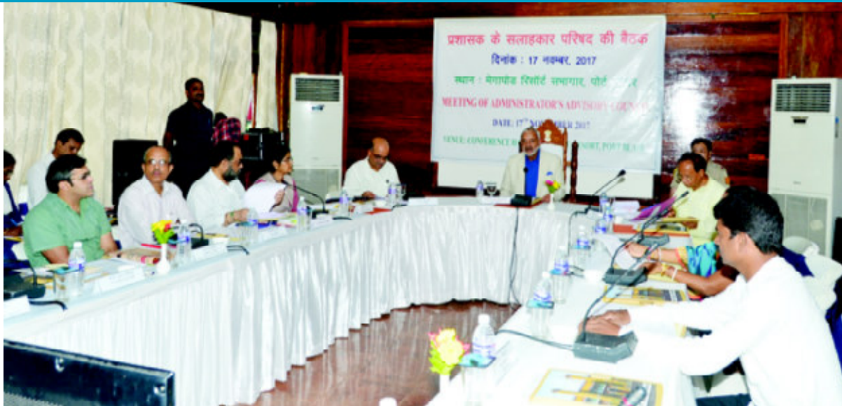
The Lt. Governor, Admiral D K Joshi, PVSM, AVSM, YSM, NM, VSM (Retd.), chairing the meeting of Administrator's Advisory Council at Megapode Resort on 17.11.2017.

Speaking on the occasion, the Lt. Governor said, this meeting will be held on a regular basis now onwards as all agenda and broad policy issues for the holistic development of the Islands are discussed during this meeting. Thanking the participants for their valuable suggestions, the Lt. Governor said, all issues raised by them and their suggestions have been noted. All proposals will be discussed further and the appropriate ones will be taken up for implementation. He also urged the officers of the Administration to conduct more outreach visits. Taking note that most people present in today's meeting highlighted about the issue of shipping services, the Lt. Governor said, additional ships will start joining the fleet of our Shipping Service from next year onwards. Power sector, he said, will be