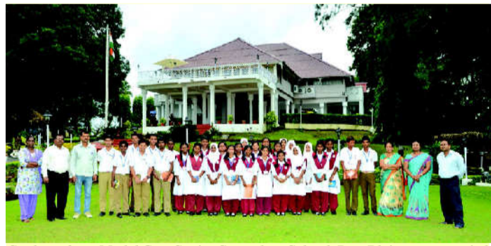
Students from Model Govt Senior Secondary School, Port Blair, accompanied by their teachers and Principal visited Raj Niwas on 17th December 2016, to see the gardens and other attractions.