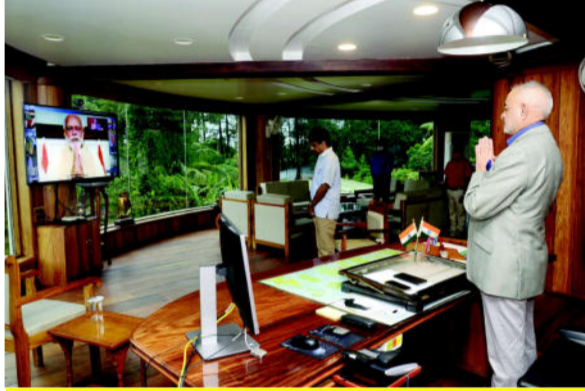
Admiral D K Joshi, PVS, AVSM, YSM, NM, VSM (Retd.), Hon'ble Lt Governor, A&N Islands and Vice-Chairman, Islands Development Agency and Shri Chetan B.Sanghi, Chief Secretary attended the Video-Conference chaired by Shri Narendra Modi, Hon'ble Prime Minister of India & Shri Amit Shah, Hon'ble Home Minister with CMs of States/UTs. They also paid homage to martyrs of Galwan Valley. Discussed best practices and resumption of infrastructure development projects .of the Islands.

Prime Minister talked about the presence of better health infrastructure and trained manpower to meet the challenge. He highlighted the increase in domestic manufacturing capabilities of PPEs, masks, availability of diagnostic kits in adequate quantity, supply of ventilators made in India using PM CARES fund, availability of testing labs, lakhs of COVID special beds, thousands of isolation and quarantine centres, and adequate human resource through training. He underlined the need to give constant emphasis on health