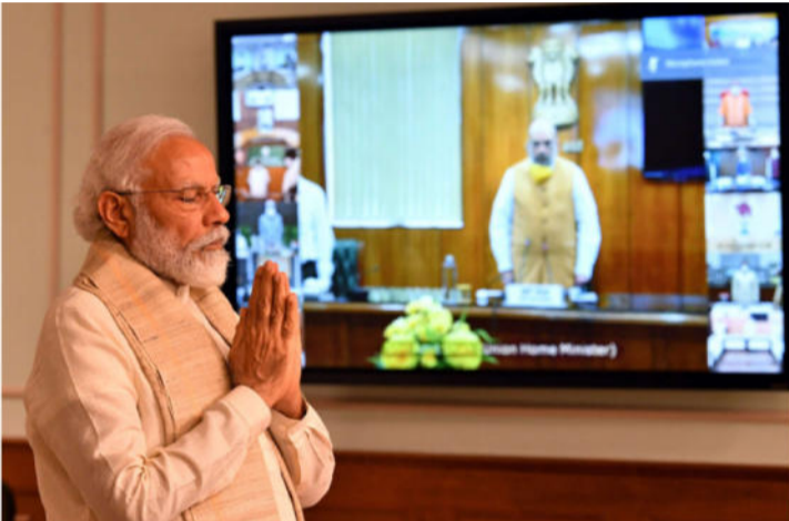
The Prime Minister, Shri Narendra Modi paying tributes to the Martyrs of Galwan Valley during the Virtual Conference with the Chief Ministers in New Delhi on June 17, 2020.