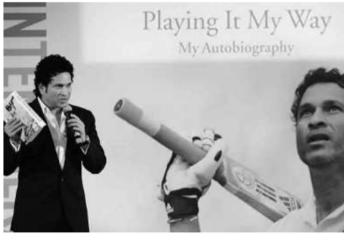
crore with its cover price being Rs 899.

New Delhi, Feb 18 He might have bid adieu to cricket but Sachin Tendulkar continues to make records with his autobiography 'Playing It My Way' entering the Limca Book of Records for being the best-selling adult hardback across both fiction and non-fiction categories. The book, published by Hachette India, was released on Nov 6, 2014 and has broken all records for an adult hardback across both fiction and non-fiction categories with 1,50,289 copies confirmed on order subscriptions.