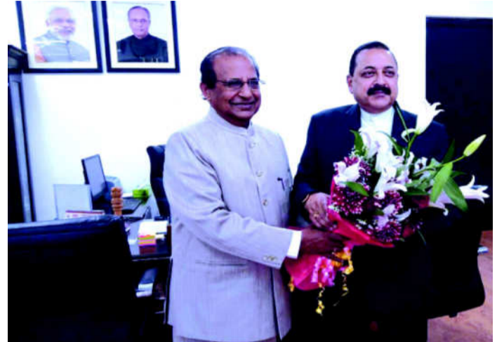
Hon'ble Lt Governor of A & N Islands, Prof Jagdish Mukhi during his visit to New Delhi called on Hon'ble Minister of State (Independent Charge) for Personnel & Public Grievances, Shri Jitendra Singh on 18th February 2017. Various issues pertaining to the A & N Islands were discussed during the meeting.

The Union Health Minister, Shri JP Nadda launched the second phase of National rota virus vaccination under Universal Immunisation Program in Agartala today. Shri Nadda said, launching of Rotavac vaccination from Tripura is a message that the Central Government focuses upon North East region. He said, Prime Minister Shri Narendra Modi has given utmost importance upon development of this region.