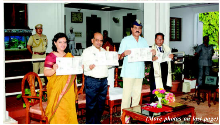
(More photos on last page)