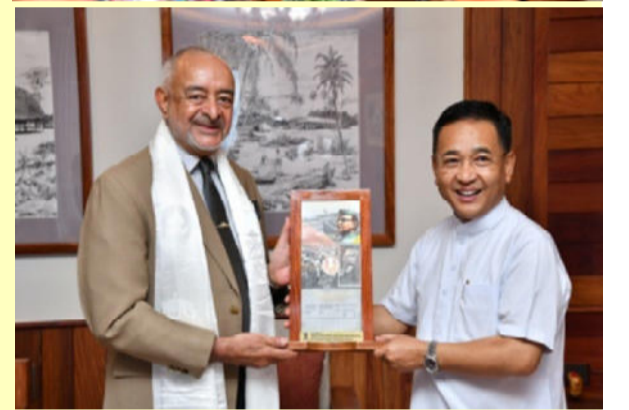
Hon'ble Chief Minister of Sikkim, Shri Prem Singh Tamang on his visit to A&N Islands met Admiral D K Joshi, PVSM, AVSM, YSM, NM, VSM (Retd.), Hon'ble Lt Governor, A&N Islands and Vice-Chairman, Islands Development Agency today at Raj Niwas. Discussed prospects of development in tourism and hospitality sectors.