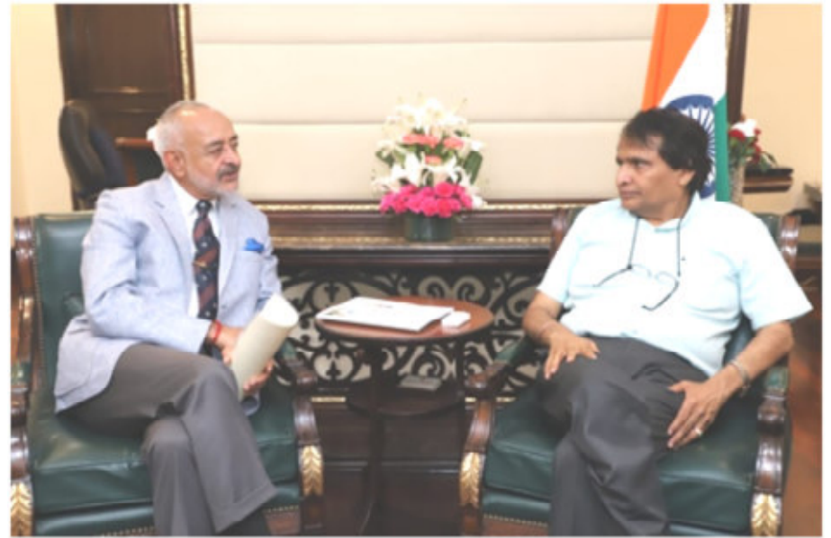
Admiral D K Joshi, PVSM, AVSM, YSM, NM, VSM (Retd), the Lt. Governor of Andaman & Nicobar Islands & Vice Chairman Islands Development Agency, called on Shri Suresh Prabhakar Prabhu, the Minister of Civil Aviation at New Delhi on June 15, 2018. Various matters relating to upgradation of Civil Aviation infrastructure in Andaman & Nicobar Islands were discussed.