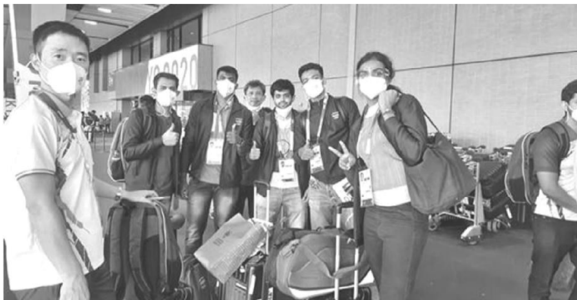
New Delhi, July 18 (PIB)

88 member Indian contingent including 54 athletes arrives in Tokyo Contingent was given a spirited send-off last evening by Union Sports Minister and MoS Sports