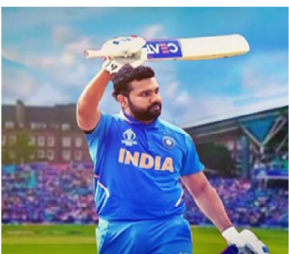
M a r i a p p a n for the Khel Ratna Thangavelu have Awards.

Along with Rohit Sharma, Asian Games gold medalist Vinesh Phogat, table tennis champion Manika Batra and Paralympic gold medalist