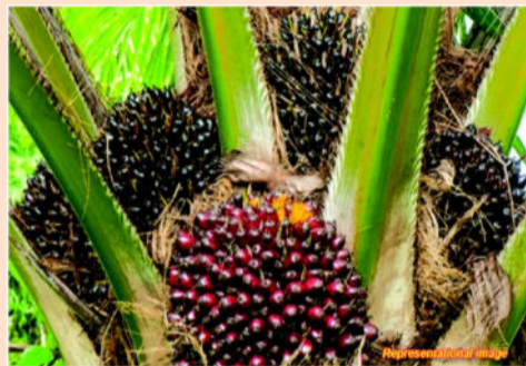
lakh tonnes by 2029-30.

Under this scheme, it is proposed to cover an additional area of 6.5 lakh hectare (ha.) for oil palm till the year 2025-26 and thereby reaching the target of 10 lakh hectares ultimately. The production of Crude Palm Oil (CPO) is expected to go upto 11.20 lakh tonnes by 2025-26 and upto 28