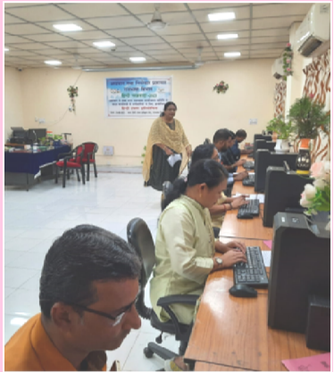
of Official Language, A&N Administration, a press release from OL Deptt. said.

Port Blair, Sept. 18 As part of the observance of Hindi Fortnight-2023, a Hindi typing competition was organized today at Hindi Typing Training Centre of the Department of Official Language for the employees of various Departments/Offices of A&N Administration and member offices of the Town Official Language Implementation Committee. A large number of Government employees participated in the competition. Tomorrow (Sept.19) at 10 am, a Hindi writing competition will be organized for multi-tasking employees of various Departments/Offices of Andaman and Nicobar Administration in the Hindi Typing Training Center of the Department