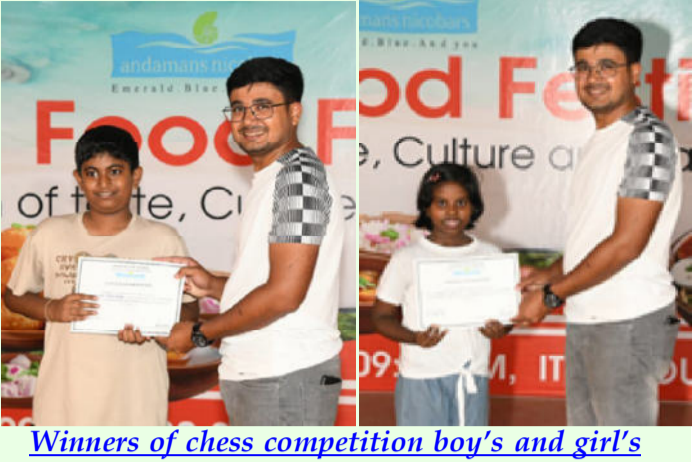
Winners of chess competition boy's and girl's

Mementoes were presented to the participants of cultural programmes while Certificates were distributed to stall vendors. Officials from the Tourism Department expressed