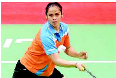
runners-up Japan. The Indian Men's team continued its dismal run in the Thomas Cup and crashed out after being blanked

Indian women shuttlers will take on Thailand in the quarterfinals of the Uber Cup Badminton tournament at Kunshan, China today. Indian women's team yesterday qualified for the quarterfinals despite suffering a narrow 2-3 loss to Japan in its third and final Group D match. Ace shuttlers Saina Nehwal and P V Sindhu notched up straight-game victories in the first two singles but Indian eyes could not win the two doubles and third singles to go down fighting to 2014