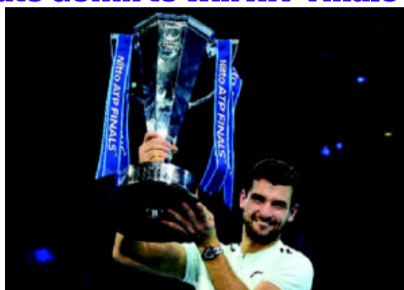
Rafael Nadal and Roger Federer as he begins to deliver decisively on his rich promise as a youngster.

In a surprise final match-up, the Bulgarian sixth seed held his nerve under intense pressure at London's O2 Arena to seal the biggest title of his career on his fifth match point. He will climb to third in the rankings behind only