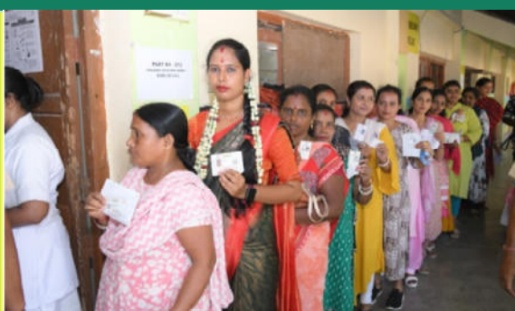
Voters queued up in various Polling Stations to cast their votes