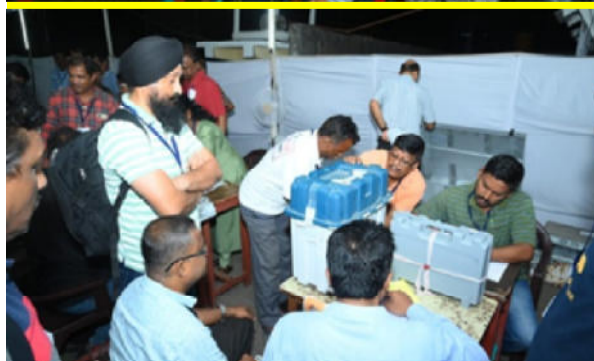
Polled EVMs being collected at the Collection Centre at JNRM Strong Room