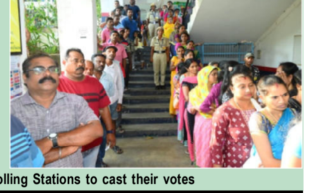
Voters queued up in various Polling Stations to cast their votes