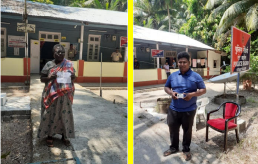
Voters belonging to the Great Andamanese Tribe from Strait Island cast their vote