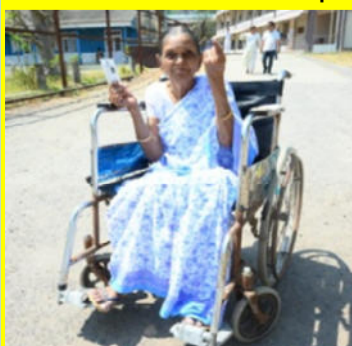
A proud senior citizen showing her ink marked finger after casting her vote