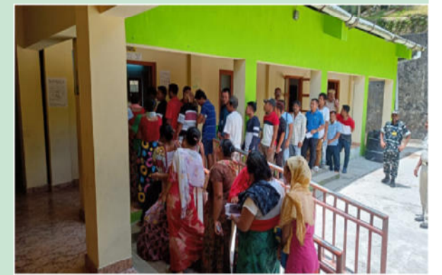
Munak Village, Kamorta joins in the democratic process for General Elections-2024