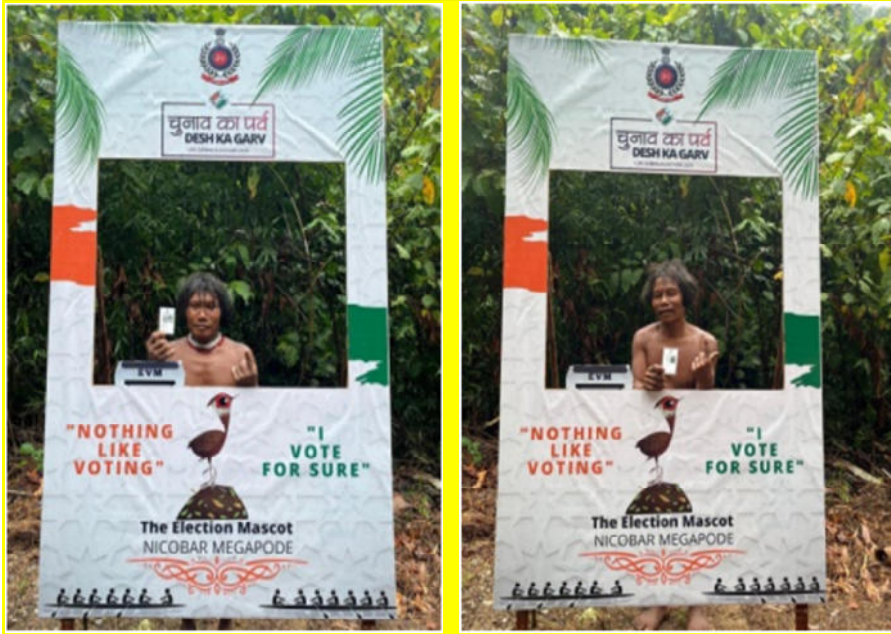
A historic moment unfolds as the Shompen tribe of Great Nicobar cast their votes for the first time in General Elections-2024