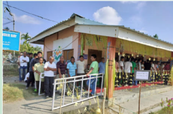
Voters from Harminder Bay queued up to cast their votes in General Election to Lok Sabha