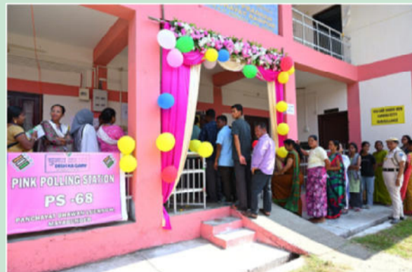
Voters cast their votes at Pink Polling Station, Mayabunder