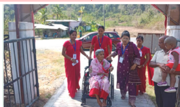
Senior citizen being assisted to cast her vote at Diglipur

ensuring realistic and effective measures for voter participation among its personnel serves as a model for democratic engagement, a press release from HQ A&N Police said.