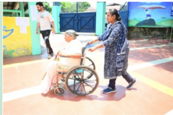
Senior citizens exercised their franchise at their respective polling booths

collected at the Collection Centre at JNRM Strong Room since this night for Port Blair and Ferrargunj Tehsils. Similarly, far-flung Tehsils i.e. Campbell Bay, Nancowry, Car Nicobar, Diglipur, Rangat, L i t t l e Andaman the Polled material and EVMs are being collected at the designated Collection Centres at each Tehsil HQ. Thereafter, EVMs and Polling materials will be transported to JNRM Strong Room.