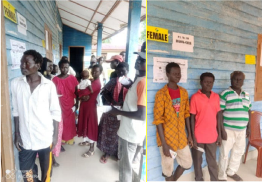
Onge tribe from Dugong Creek exercised their franchise in the General Election