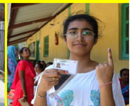
First time voter exercised her franchise in the General Election