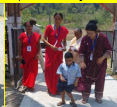
PwD voter being assisted by Anganwadi Workers to cast vote at Village Sitanagar in Diglipur