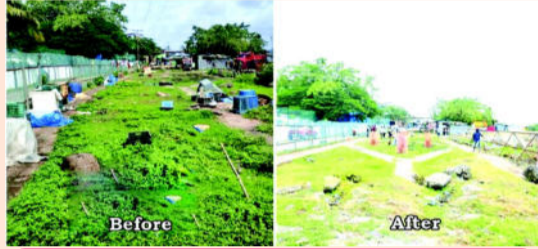
PBMC plants saplings of cashew, guava, jackfruit, lemon at Mini Children's Park, Junglighat

To get this mission on ground, a committee will look into it which will be headed by PCCF, Secretary (Agriculture) and Secretary (APWD). All persons getting contract in Port Blair