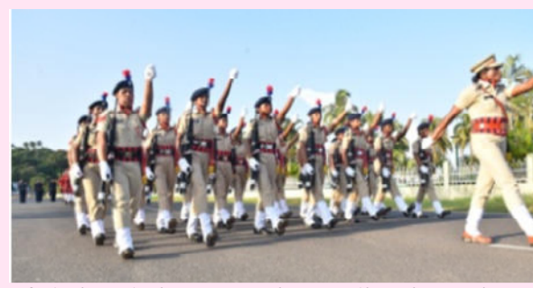
of their role in preserving India's integrity, a press release from SP (APU) said.

Andaman & Nicobar Police's dedication to upholding the spirit of unity and patriotism inspired by Sardar Patel's legacy. It not only honors the sacrifices of those who unify and protect the nation but also reminds each citizen