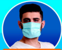
Wear your mask properly