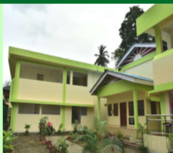
in various schools.

The Education Department of A&N Administration is giving emphasis on providing quality education to children by ensuring the required facilities are made available to them in Govt. Schools across the Islands. In order to strengthen the existing physical infrastructural facilities in Govt. Schools of A&N Islands, the Department has already initiated a number of steps which includes construction of classrooms, Science Labs, hostels, toilets etc.