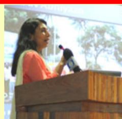
children and shared with parents, CDPOs, Health Deptt., Education Deptt. and ICMR for individual tracking, monitoring of all children, to identify

In this regard, the Department created a data of malnourished