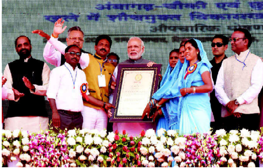
Earlier, the Prime Minister visited an exhibition at the venue, which showcased the implementation of development schemes, and handicrafts.

The Prime Minister said the country is taking a new direction of development. He said one example of this was that the important Rurban mission was being launched not from New Delhi, but from Kurubhat, in Rajnandgaon district of Chhattisgarh. He said that Government was now being brought to the doorstep of the villages and the tribal communities. The Prime Minister congratulated villages and communities of nearby areas for achieving Open Defecation Free status.