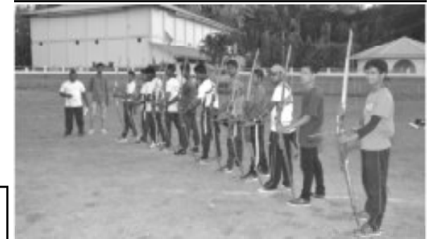
As part of the ongoing ITF 2018, various sports events are also being organized. Accordingly, for the first time, an archery contest was organized which saw enthusiastic participation from a large number of players.

area with an aim to enhance personal health for everyone. While addressing the CG fraternity, he emphasized the importance of personal health and advised to inculcate sports and games activities in every ones daily life. The Coast Guard Commander further asked everyone to use these facilities to achieve healthy body and mind.