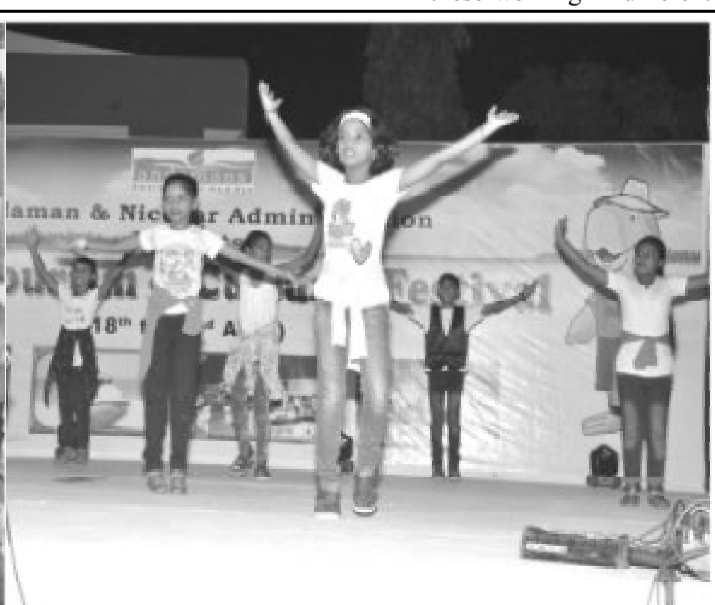
It being a Saturday, a colossal crowd thronged the venue of the ITF viz the Marina Park road, Girls School Campus, Andaman Club etc on April 21. Sundry activities, stalls of food and artifacts attracted the people of all ages till late.

Stop polluting the Earth and follow reduce, reuse, recycle regime.