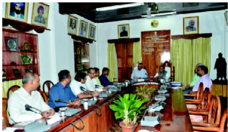
Hon'ble Minister of State for Law & Justice, Electronics & IT, Govt. of India, New Delhi, Shri P. P. Chaudhary, currently on visit to these Islands, holds meeting with Lt. Governor A & N Islands, Prof. Jagdish Mukhi and senior officers of the A & N Administration at Raj Niwas on 21.06.2017

Netaji Sports Complex, Mayabunder was selected for the mass Yoga demonstration at the District Head Quarter, Mayabunder. The Deputy Commissioner, (Contd. on last page)