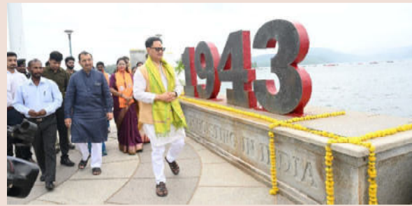
Hon'ble Minister visits Flag Point

The Hon'ble Union Minister also visited the New Terminal of Veer Savarkar International Airport, Sri Vijaya Puram, where he witnessed the remarkable transformation brought about through major infrastructure upgrades. As part of the Pragati Padh Yatra, he reviewed the developmental initiatives carried out over the past 12 years and paid floral tributes to Veer Savarkar ji, recalling his invaluable contribution to the nation. The modern airport terminal reflects the Government of India's focus on enhancing air connectivity, strengthening tourism potential and providing better facilities to the people of the Islands.