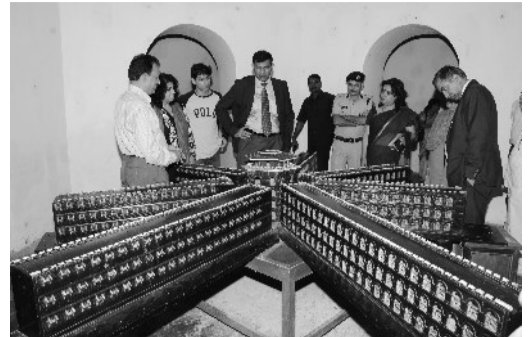
RBI Governor at National Memorial Cellular Jail on 21-12-2015