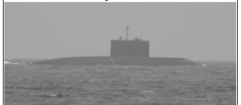
INS Sindhuraj had entered Port Blair on an operational visit on 19th December & was here till 21st December before proceeding for her remaining leg of deployment. She is an EKM Class Submarine fitted with state of the art weaponry and sensors.