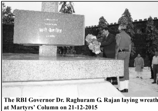
The RBI Governor Dr. Raghuram G. Rajan laying wreath at Martyrs' Column on 21-12-2015