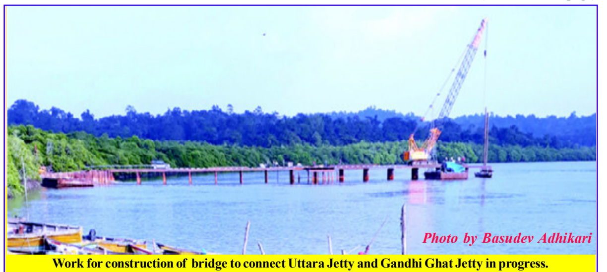
Work for construction of bridge to connect Uttara Jetty and Gandhi Ghat Jetty in progress.

tour, visits were organised to Ross Island, Forest Museum, Cellular Jail and FDN-1. The environmental and ecological sensitivities of the Islands have been focused upon specifically (Contd. on last page)