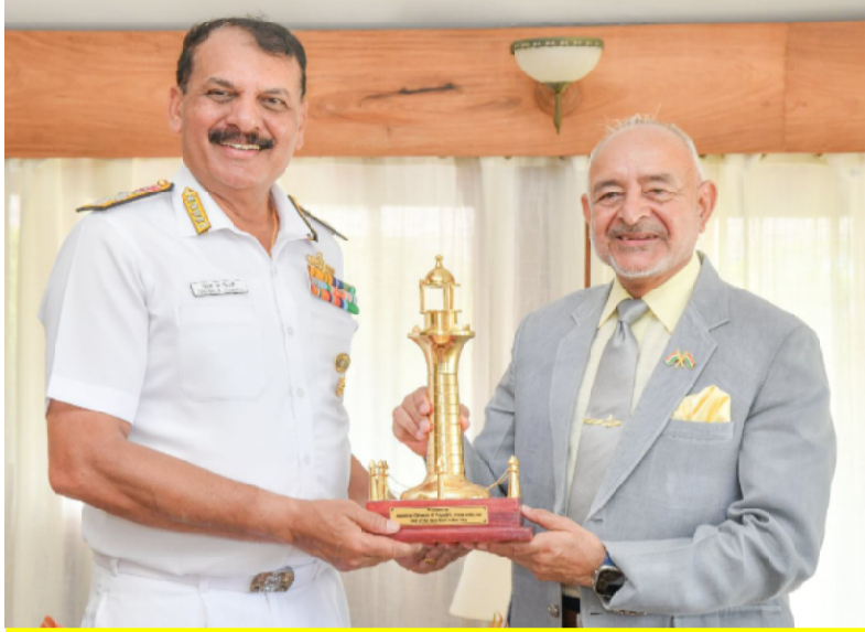
Admiral Dinesh K Tripathi, PVSM, AVSM, NM, Chief of Naval Staff on his two days visit to A&N Islands from 21 st -22 nd April 2026 called on Admiral D K Joshi, PVSM, AVSM, YSM, NM, VSM (Retd.), Hon'ble Lt. Governor, Andaman & Nicobar Islands and Vice Chairman, Islands Development Agency today at Lok Niwas, Sri Vijaya Puram.